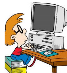
Visit these sites for kindness ideas.

ers and childcare professionals, but has plenty of ideas that you would be able to adapt for your family. If you want to take some time to focus on kindness, use some of the ideas, quotes, and activities. There is a list of 100 Kindness Ideas for Adults on Page 2 that you would easily be able to do with your child.